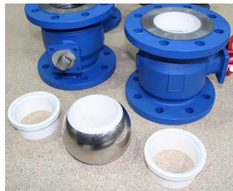
All components of the new ceramic/steel ball valve in direct contact with the processed material are made of ceramics.