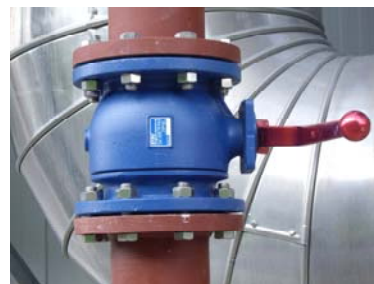
Ceramic/steel ball valve operated in a power station.